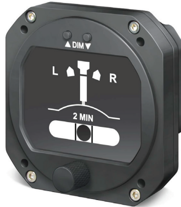
TURN AND BANK